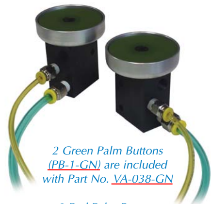
2 Green Palm Buttons (PB-1-GN) are included with Part No. VA-038-GN

The CM-038 subplate is available with 1/8" NPT and #10-32 threads